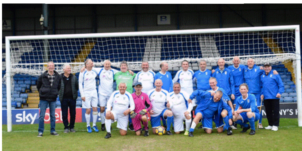
Bury Relics Gigg Lane Tournament winners and Shield winners. May 2019