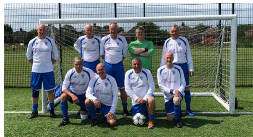
Fleetwood tournament, July 2019