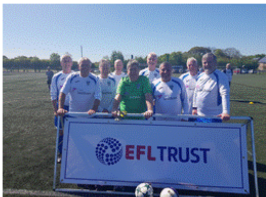
EFL tournament at Bolton Wanderers, May 2018