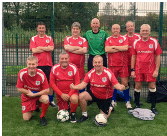
The Relics first season - GMWFL 2017 Autumn season