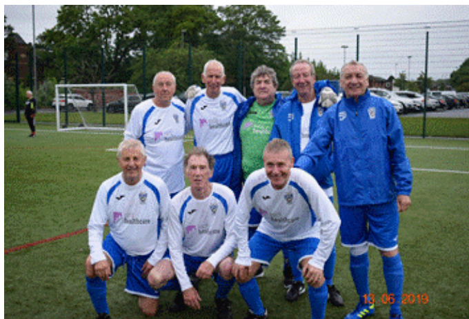
Over 65's Champions – Spring 2019

Continuing the Relics success, only a week after the over 60's won the Division 2 title, the over 65's were not to be outdone, clinching the over 65's Division 1 in a tense last round of games. Going into the day the Relics were four point clear and managed to maintain their top spot on a difficult day finally coming out Champions by 2 goals, pushing a very good Rochdale team into second place.