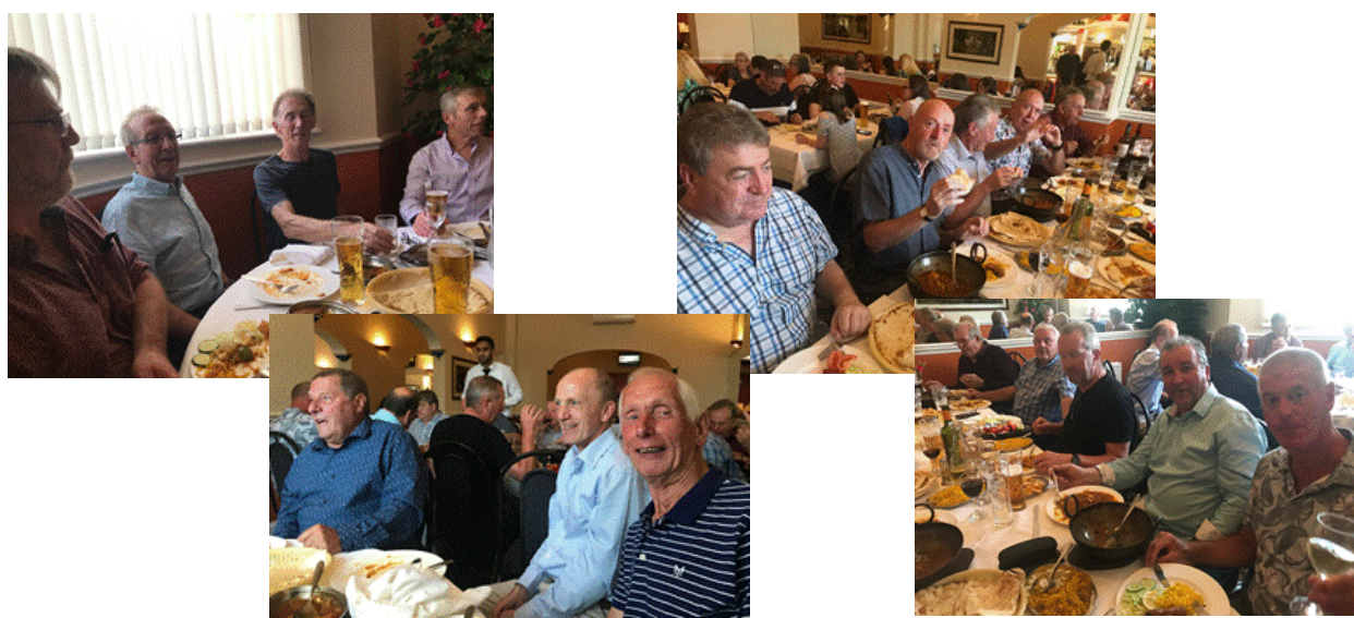
June 2019 Curry Night. - Don't worry boss, we'll run it off at the next training session

It's not all football with The Bury Relics, there is a great social side too with end of season social events, curry nights and golf days.