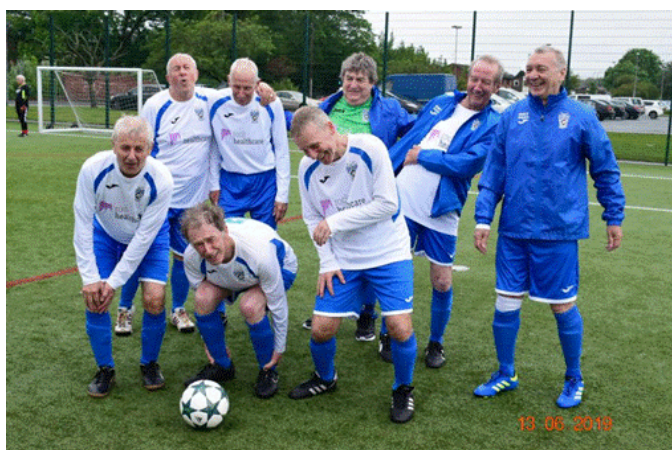
... and we've all got injuries 😊