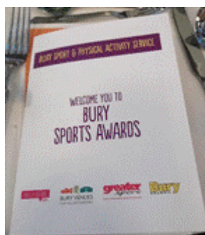
Bury Sports Awards 2018