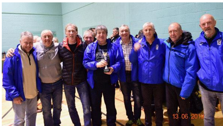
Over 65's Champions – Spring 2019.