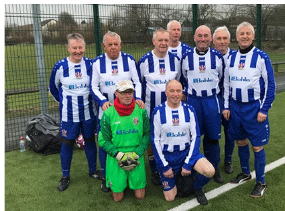
Vintage Relics featuring four Relics players

Third place for the joint Vintage Relics