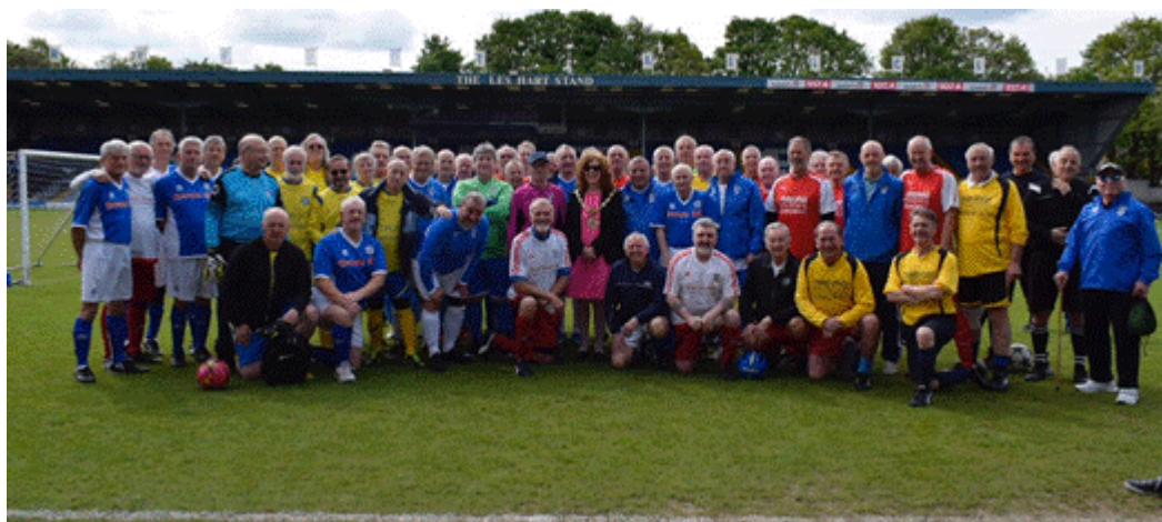
Eight teams entered the inaugural Relics tournament. May 2019