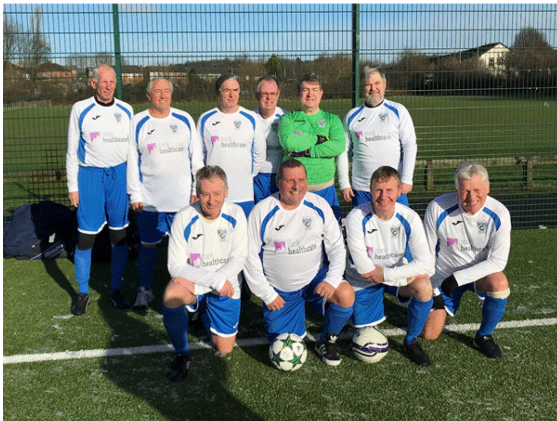
The Relics in a shiny new kit for the 2018 Spring season

Following on from the Autumn 2017 league success the team looked forward to the Spring 2018 season.