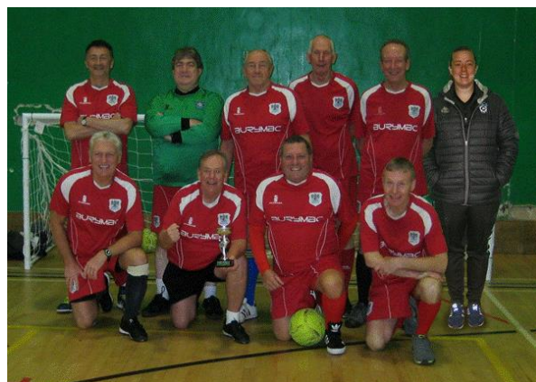
The over 60's team with the GMWFL Div 3 runners up trophy.