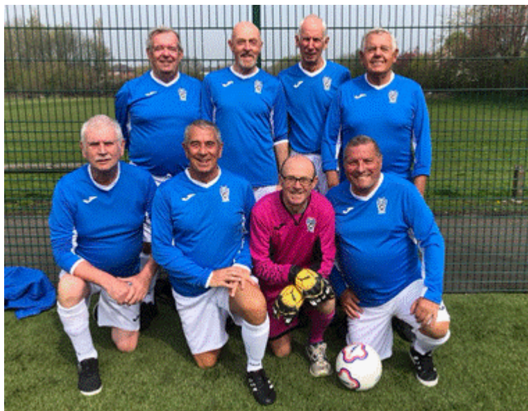
The Relics first over 70's team finished in 4th place in the league.

Only 1 point separating 2nd, 3rd, and 4th place