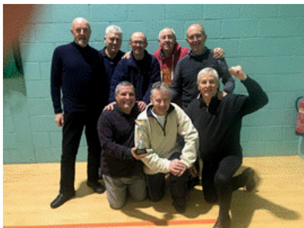
Jubilant Relics with the over 65's runners up trophy

A really strong season for the first over 65's Relics team, finishing runners up to a dominant Rochdale team that had been supreme in this age group for the past few seasons.