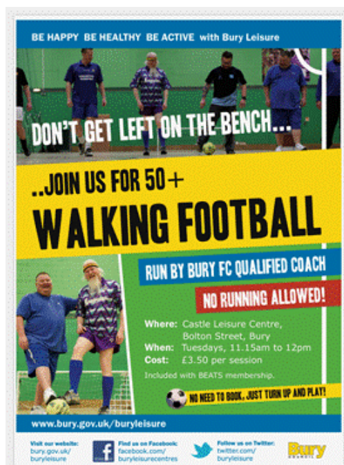
Image of the original 2016 poster advertising Walking Football at Castle Leisure Centre

The Relics joined the GMWFL in August 2017 ready for the Autumn season which started in September 2017; at that point The Relics only had enough players for an over 60's team.